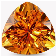
November Birthstone Yellow Topaz