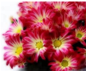
November Flower Chrysanthemum