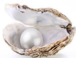
June Birthstone -Pearl-