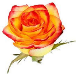
June Flower -Rose-